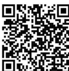
Wider Reading Lists