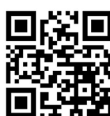
High Fliers Padlet

Departments also invite guest speakers to visit the school. On Wednesday 14th January, 30 students from Years 11 and 12 attended an extracurricular talk in the Beal Maths School delivered by representatives from Queen Mary, University of London. The session formed part of the school's ongoing commitment to providing high-quality careers education and widening participation opportunities.